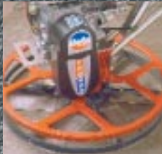
Pro 600 with spinning ring