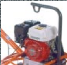
Central lifting point and engine protection