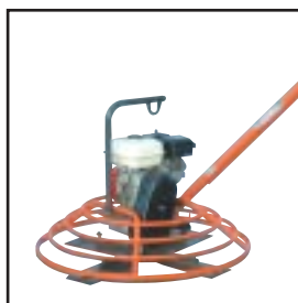
Utility Pro 900/1200