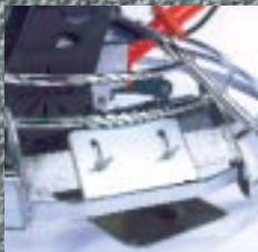
Pro-Tilt edging ring