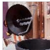
Easy to clean tub and paddles