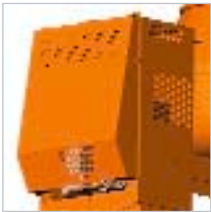
Strong anti-theft lock