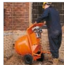
Wheeled for easy transport