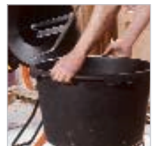
Mix and shift in the tub