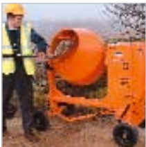
Designed to cope with the most demanding site conditions