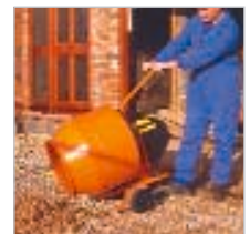
Easily wheeled to the job