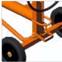
Foot operated hand wheel locking