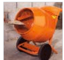
Compact, ideal for small jobs