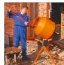
Light and effective, the Minimix 130 mixes a full barrow load