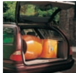
■ Portable and light, compact enough for the car boot