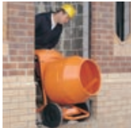
■ Operates in confined spaces