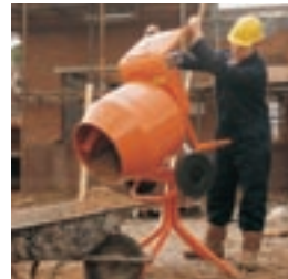
■ Portable stand allows barrow height mixing and tipping