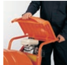
■ Easy access cover top for fuel and maintenance