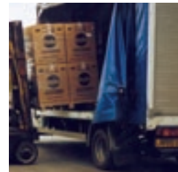
■ Available boxed for easy stocking and transport