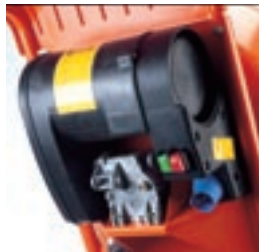
■ Proven gearbox. ■ Increased motor protection (IP45).