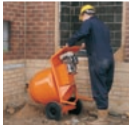
■ Wheeled for easy transport

Belle Group Products are 'Built for the Job', with a proven reputation for high quality whatever your building requirement.