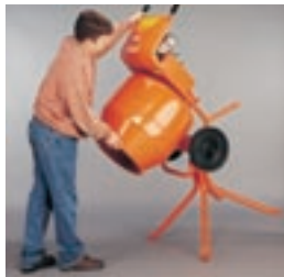
■ Safe and simple assembly